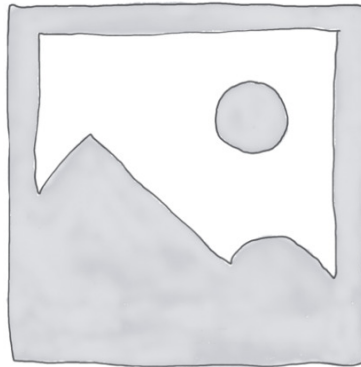
Dimensional drawing coming soon

Please observe: This freezer counter for connection to remote cooling system is on special order only. Please take longer lead times into consideration