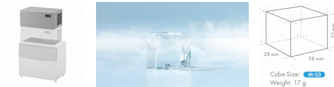
Cube Size: M-23 Weight: 17 g