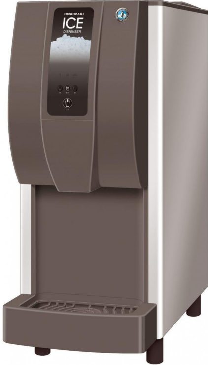
ICE TYPE: Cubelet + Water